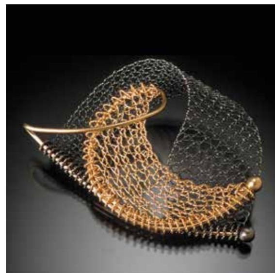
Image 3 (above): Captured Crescent, Wire bobbin lace brooch in gold and silver, Lauran Sundin

Priest's House Museum, Wimborne BH21 1HR www.priest-house.co.uk Telephone: 01202 882533