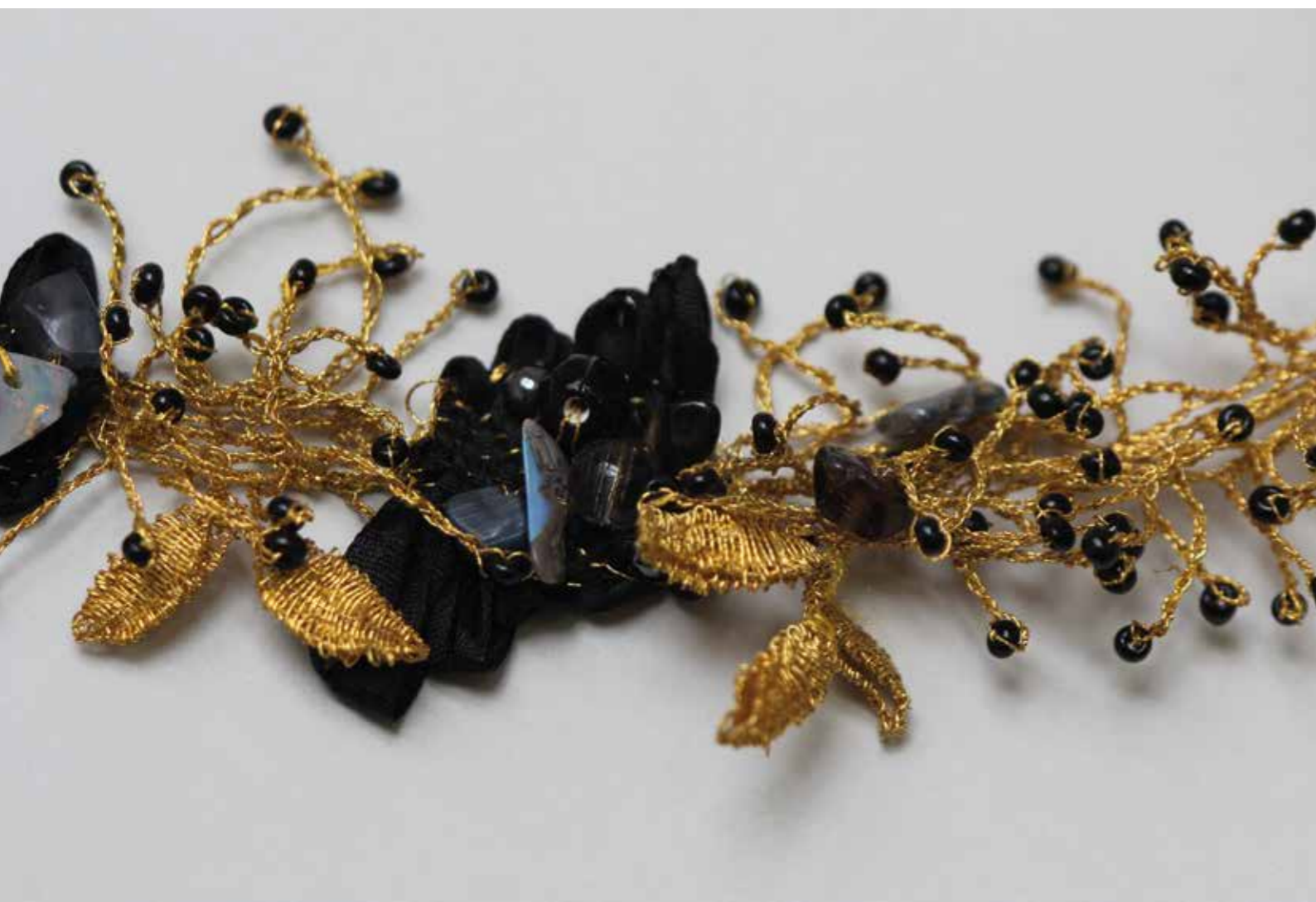
Image 4 (below): Bobbin lace necklace in pure gold thread, Denise Watts